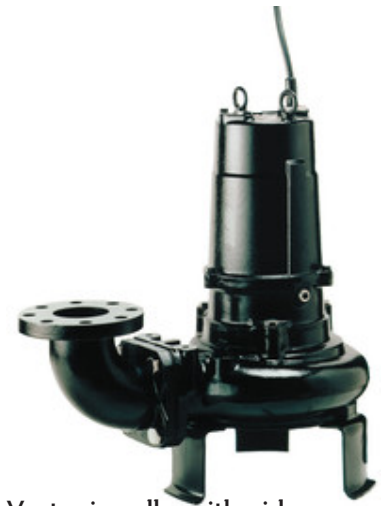
Vortex impeller with wide pump casing, 4-pole motor, no clogging.