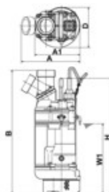
W1: lowest running water level

In the event of abrasive and corrosive utilization, stronger wear and tear will take place naturally in certain components. In this regard, please pay attention to our website www.tsurumi.eu/english/applications.htm .